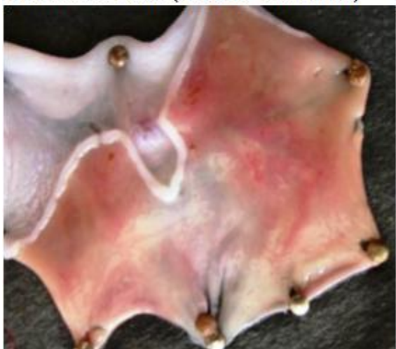
FIG. 3: ANDA LEGHYAM (250MG/KG)