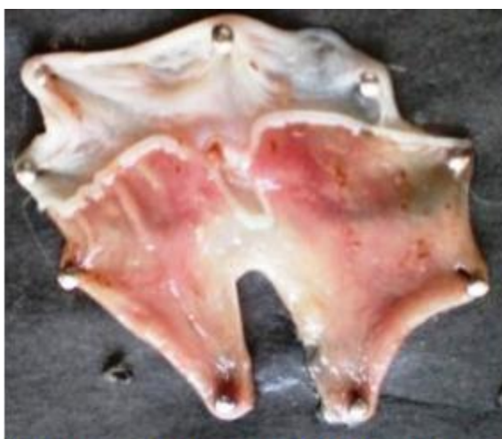
FIG. 1: CONTROL (ASPIRIN 400MG/KG)

The study elucidates that AL has significant anti-ulcer effect by virtue of its anti-secretagogue and antacid/acid neutralizing activities on experimental animals with ulcer induced by aspirin ( Fig. 1-6 ).