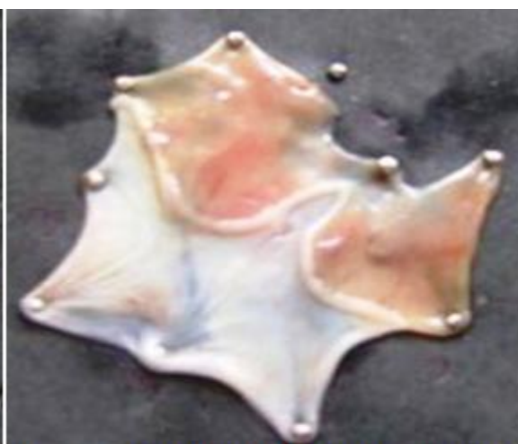
FIG. 2: STANDARD (OMEPRAZOLE 10 MG/KG)