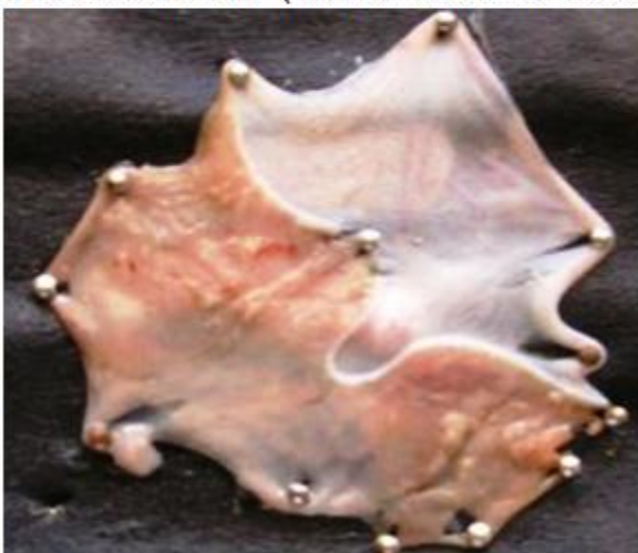
FIG. 4: ANDA LEGHYAM (500MG/KG)

It showed a dose dependent protection against aspirin (400mg/kg body weight) induced ulcers in rats and it produced a significant reduction of ulcer index in the dose of 500mg/kg body weight. AL showed statistically significant P values < 0.05 and < 0.01 at the dose levels of 250mg/kg and